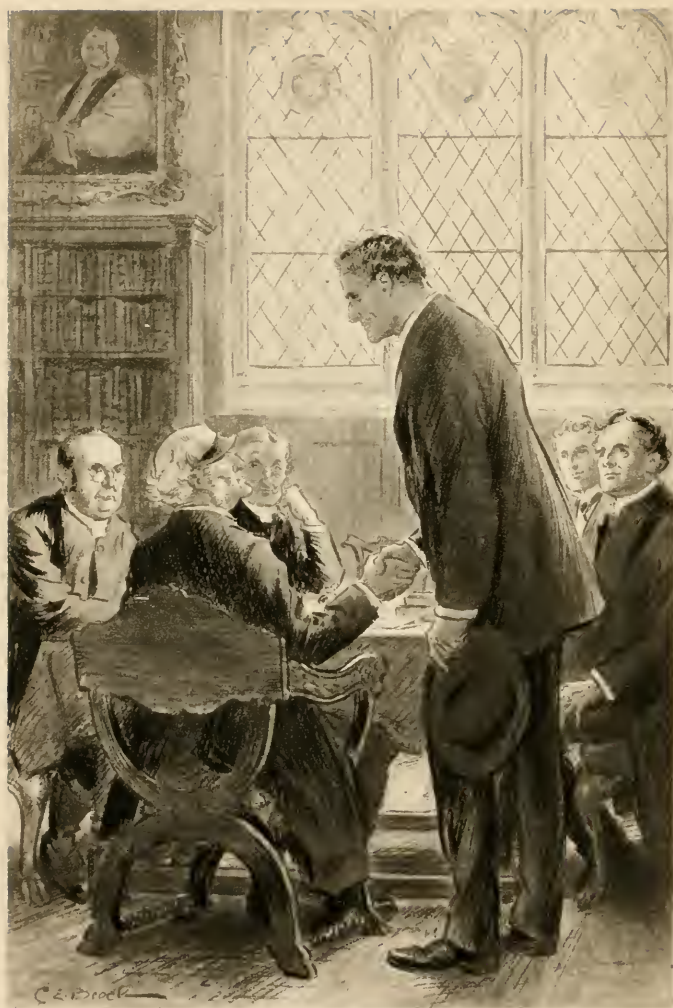
“He shook hands with the Dean”